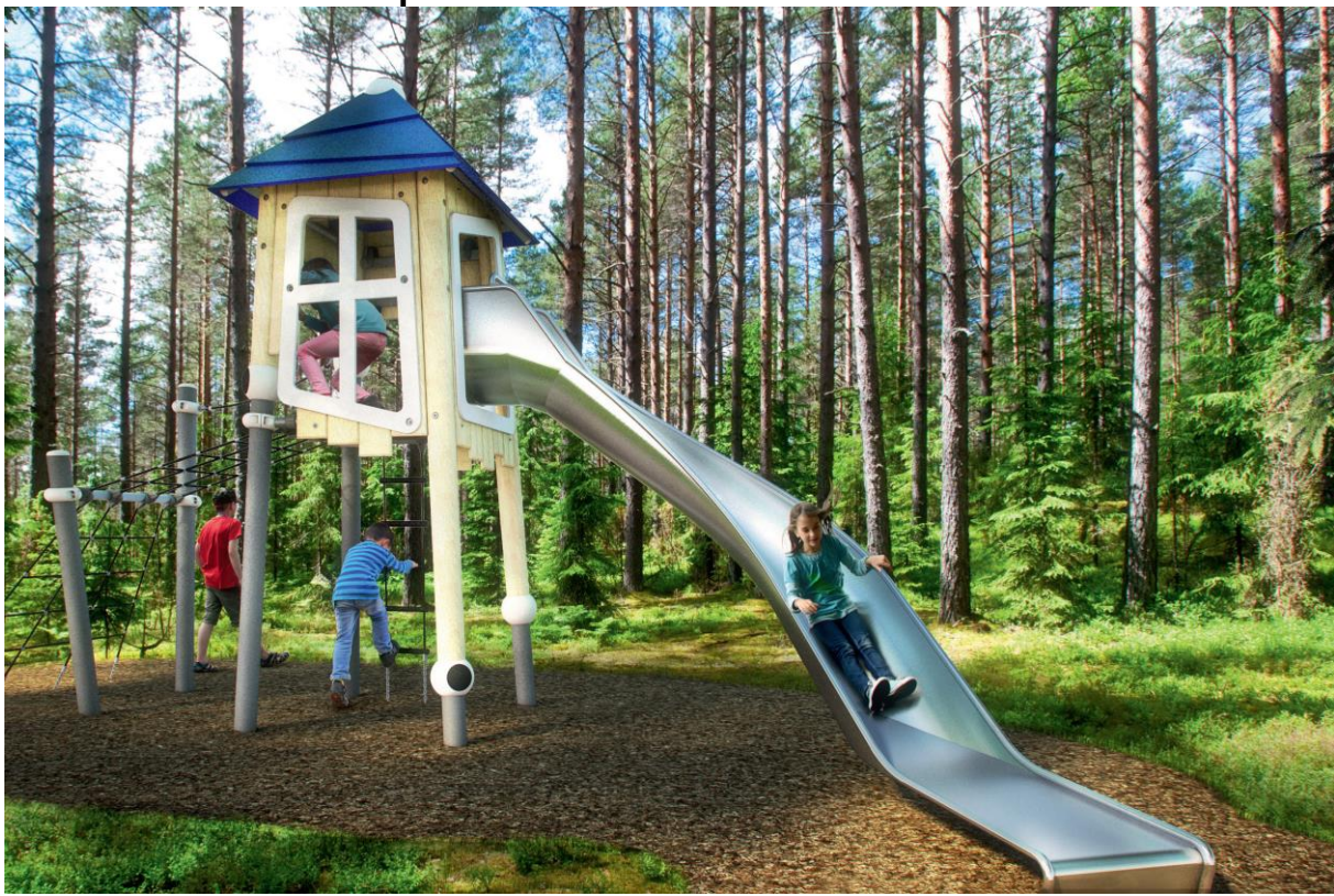
Shack 2 01

Shack2 with its platform height of 1.9 m is the larger one of the two systems. In this variant, the posts are slanted inward. The ascent of Shack2.01 nearly reaches 2 metres using the access net or the rope ladder to reach the playhouse. A curved slide sweepingly brings you back to the ground.